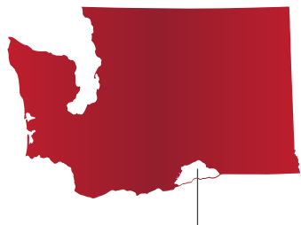
HORSE HEAVEN HILLS AVA Located in South Central Washington

The 2019 vintage started off with a late winter with several days of below average temperatures in June. Heat units rose throughout the early summer providing an optimal window to ripen our cherished white varietals. An abnormal early frost of freezing temperatures throughout Eastern Washington made this vintage one to remember.